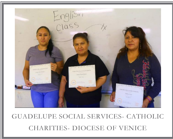
GUADELUPE SOCIAL SERVICES- CATHOLIC CHARITIES- DIOCESE OF VENICE